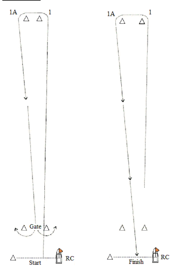
Start - 1 - 1A - Gate - 1 - 1A - Finish

Start – Finish may be between either the RC boat displaying an orange flag and a nearby mark or